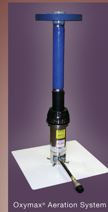
Oxymax® Aeration System

Whether it's Aeration or Beauty you want to achieve, ask for The Industry Leader, AquaMaster®! We offer quality and dependable Fountains and Aerators for all your aquatic requirements. At AquaMaster, we are committed to excellence with every product we design and manufacture. Let us help you Master the Power and Beauty of Water. For more information please contact us at +1-920-693-3121 or visit www.aquamasterfountains.com