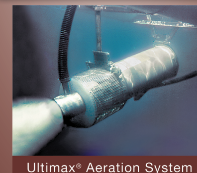
Ultimax® Aeration System