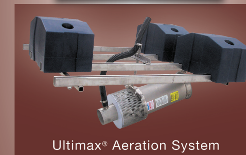
Ultimax® Aeration System